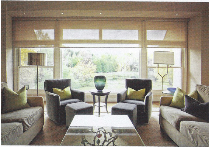
The contemporary living room affords magnificent views of the pond and countryside beyond the back of the property. BOTTOM LEFT: A Muskoka-like sunroom is a cosy spot to relax year-round. BELOW: Cathedral ceilings and wall-to-wall windows open up the main living area.

The hardwood floors are quarter sawn white oak, stained a walnut colour and show off two large, custom hemp area rugs from Elte. The kitchen and hallway feature 12-by-24-inch Lagos blue honed limestone floors that beautifully complement the eucalyptus-stained kitchen cabinets built by Louie Katsis of Olympic Kitchens. Continued on page 54